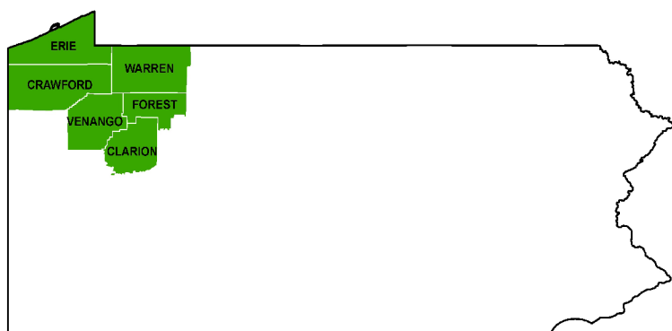
Workforce Development Area (WDA) Unemployment, Jan 2011 to Apr 2021